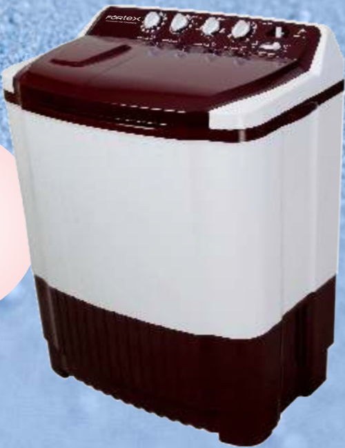
Fx8501 8.5KG TWIN TUB ECO WASH