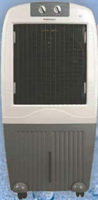
i Slim 70 LTR SWEEP 16" HONEY COMB PADS