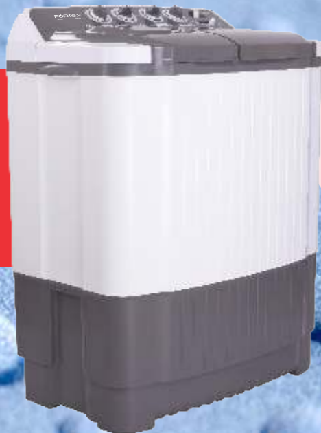
FX901 9.0 KG SUPREME WITH SALT WATER TECHNOLOGY