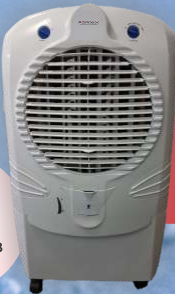
i COOL ARCTIC 55 LTR SWEEP 16" HONEY COMB PADS