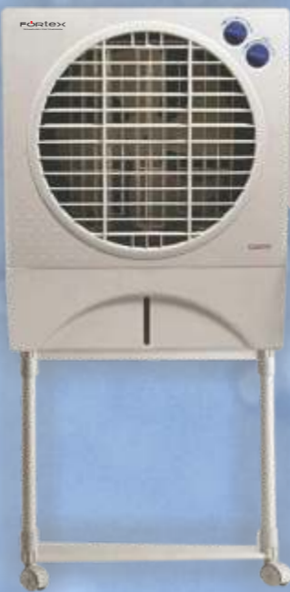
GLACIER - 30 30 LTR SWEEP 14" HONEY COMB PADS