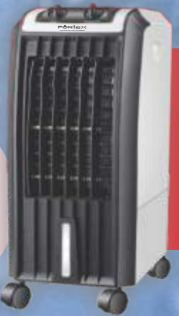
SMART 10 LTR BLOWER HONEY COMB PADS