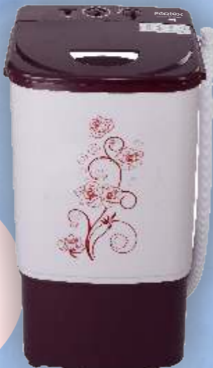
FXW801 7.5KG WASHER