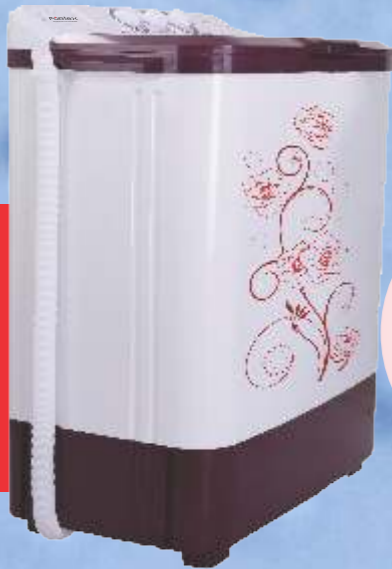
Fx701 6.8KG TWIN TUB ECO WASH